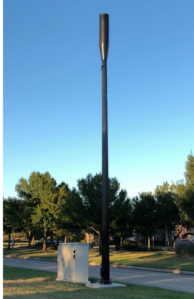
Cable Management Transition Cone